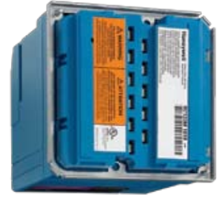
Echo's unique Smart Fit subbase, makes change out easy!

A solution that is a smart fit and allows you to make the smart choice, without the extensive wiring required in the past? That choice is Echo, the plug-in replacement for Fireye M Series Controls. Echo is based on the standard 7800 SERIES Control, which is known for its' quality and reliability. PLUS, you can now expand the functionality with displays that improve diagnostics and troubleshooting. The display provides the capability to connect the equipment to the building automation system via Modbus™. All of the standard 7800 SERIES components work with this control as well.