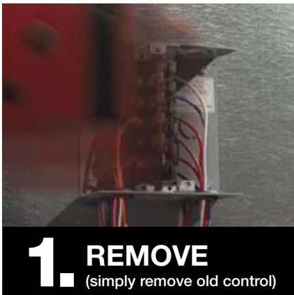
1. REMOVE (simply remove old control)

Control change-out is quick and easy. There are no wiring changes required. Simply remove the old control, add the metal frame and plug in the 7800 SERIES Control.