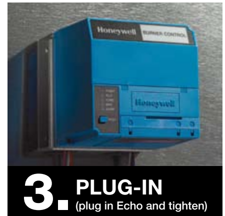
3. PLUG-IN (plug in Echo and tighten)